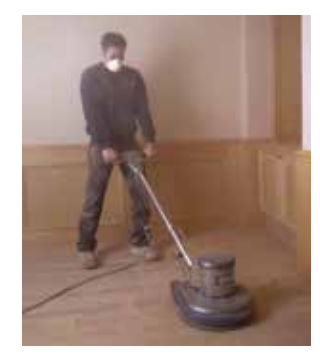
Without Dust Containment

The Bona Atomic® Dust Containment Systems, which are GREENGUARD Certified for indoor air quality, will increase your satisfaction by providing higher quality results and healthier conditions in your home.