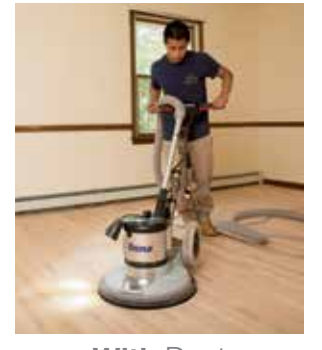
With Dust Containment